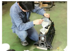
•Block filler work procedure 2 Place the block filler horizontally and use a funnel to pour the block filler into the rear water jacket hole.