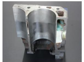
•Block filler work sequence 3 The amount of filler to be poured varies depending on the purpose. For drag races, it is recommended to pour 80-85mm from the top, and for lap races, it is recommended to pour about 90-95mm. The amount of block filler poured will reduce the cooling water volume, which will affect the water temperature and oil temperature, so the amount to be poured depends on the purpose.