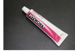
Nissan Silicone Grease Used for sealing and lubricating wheel cylinder cap rubber, etc. Price: ¥3,000