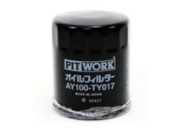
Oil Filter Part number: AY100-TY017 Suitable for: 18RG Price: ¥1,260