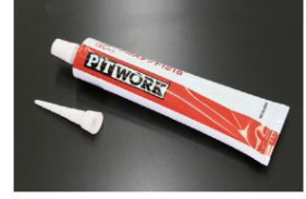
Nissan Seal Packing Gray A liquid gasket that can be used for assembling engines, transmissions, and differentials. It begins to harden about 30 minutes after application. Price: ¥3,200