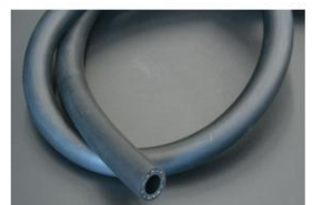
12y pressure and oil resistant rubber hose ¥2,400/1m Body ¥2,400/1m Body ¥1,200/0.5m