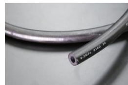
Inner diameter 9mm Fuel rubber hose (for carburetor vehicles) Unit price ¥1,400/1m