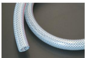
Blow-by hose Part number: 31D003 Size: Inner diameter 15y, outer diameter 22y Compatible: L type, 2TG, 18RG Price: ¥1,000/1m