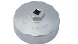
Cup-type oil filter wrench Product number: AVSA-080 Compatible with: A12-A15, U20, H20 Price: ¥2,890 *Filter diameter 80.5y