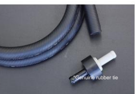
Master back hose & check valve Universal check valve ¥3,910 Universal master back hose ¥4,610 (inner diameter 9mm x 1.5M)