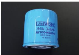
Oil Filter Part number: AY100-NS008 Fits: L20 to L28, L14yL18 Z18, Z20, FJ20 Price: ¥1,450