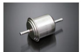
DR30 injection fuel filter (y56) Part number: 16400-0W010 Compatible with: FJ20 injection vehicles Price: ¥6,070