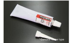
Nissan Seal Packing Black A liquid gasket that can be used for engine assembly. After drying, it forms a rubber-like elastic coating that is highly resistant to heat and oil. Price: ¥3,100