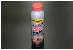
Lithlon Super Strong Water Leak Repair Agent Head Gasket Fix "A repair agent that has a high probability of permanently fixing water leaks from head gaskets Price: ¥11,670