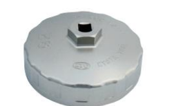
Cup-type oil filter wrench Product number: AVSA-092 Fits: L20-L28, FJ20 Price: ¥3,210 *Filter diameter 93y