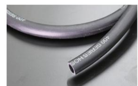
Inner diameter 11.5mm Fuel rubber hose (for carburetor vehicles) Body ¥2,400/1m Body ¥1,200/0.5m