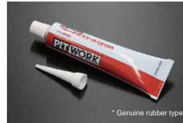
Nissan Seal Packing Bengala Liquid gasket that can be used for engine, transmission, and differential assembly. Starts to harden in about 5 minutes after application. Price: ¥2,900