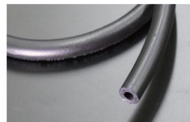
Inner diameter 8mm fuel rubber hose (For cab vehicles) Unit price ¥1,000/1m