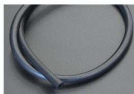
4mm Vacuum Hose ¥1,300/1m Oil-resistant rubber hose that can withstand high pressure from oil coolers, etc. Can be used for boost gauges, distributor vacuums, etc.