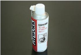
Nissan Genuine Parts Cleaner (480ml) ¥1,300 Ideal for cleaning engine parts and brakes. Quick-drying type that prevents water droplets from sticking to parts.