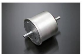
GC210/S130 Injection Fuel Filter (y73) Part Number: 16400-Q0805 Compatible with: L-type injection vehicles Price: ¥7,940