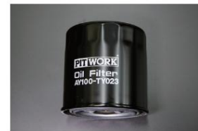
Oil Filter Part number: AY100-TY023 Suitable for: 2TG, 3TG, 2T, 3T Price: ¥1,400