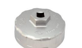
Cup-type oil filter wrench Product number: AVSA-064 Compatible with: 3K, 4K, 4AG, 3SG Price: ¥2,680 *Filter diameter 65y