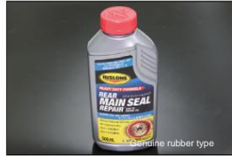
Lithlon Super Strong Oil Leak Repair Agent Main Rear Seal Repair "A rubber seal repair agent that has a high probability of repairing oil leaks from crank seals. Price: ¥3,080