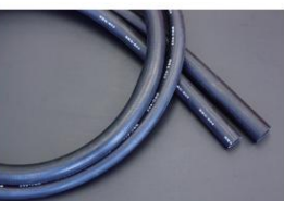
General-purpose heater hose (wall thickness 4mm, length 1m) Heater hose with inner diameter of 16y ¥1,700 Heater hose with inner diameter of 19y ¥2,000