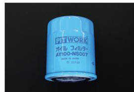
Oil Filter Part number: AY100-NS007 Compatible with: A12-A15, U20, H20 Price: ¥1,150