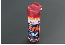
Oil spray (220ml) ¥800 A spray-type oil that is convenient for preventing rust on cams, cranks, connecting rods, cylinders, etc. during storage.