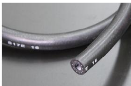
Inner diameter 6mm Fuel rubber hose (for carburetor vehicles) Unit price ¥1,000/1m