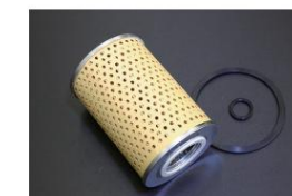
Oil Filter Part number: 15208-78525 Suitable for: S20, G7 Price: ¥1,310