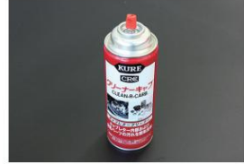
Carb Cleaner (420ml) ¥1,200 A powerful cleaner that easily removes stubborn oil stains from the inside and outside of Solex and Weber.