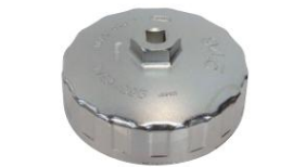
Cup-type oil filter wrench Product number: AVSA-095 Compatible with: 2TG, 3TG, 2T, 3T Price: ¥3,210 *Filter diameter 95.5y