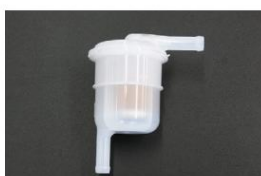
Universal fuel filter Part number: AY505-NS014 vehicles only. Suitable for carburetor for: 8mm hose. Price: ¥1,680