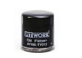
Oil Filter Part number: AY100-TY013 Fits: 3K, 4K, 5K Price: ¥1,050