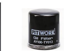
Oil Filter Part number: AY100-TY014 Compatible: 4AG, 3SG Price: ¥1,000