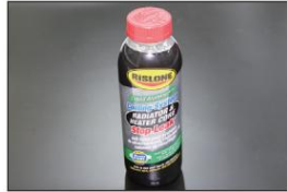
Lithlon Super Powerful Water Leak Repair Agent Radiator & Heater Core Stop Leak "Water leaks from radiators and heater cores from radiators and heater cores A repair agent that has a high probability of permanently repairing the damage. Price: ¥3,120