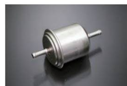
DR30 Injection Fuel Filter (φ56)

Part Number: 16400-Q0805 Compatibility: L-type injection vehicles Price : ¥11,500 (Updated 2026.01.13)