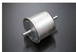
GC210/S130 Injection Fuel Filter(φ73)

Part Number: AVSA-095 (Updated 2025.4.13) Compatibility: 2TG, 3TG, 2T, 3T Price : ¥3,300 *Filter diameter: 95.5φ