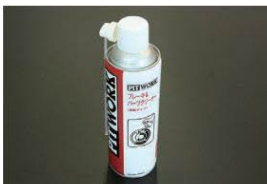
Nissan Genuine Parts Cleaner (480ml) ¥1,300

Ideal for cleaning engine parts and brake components. Fast-drying formula prevents water droplets from sticking to parts.