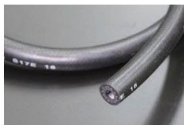
6mm inner diameter fuel rubber hose (for carburetor vehicles)