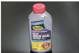
Rison Ultra-Strong Oil Leak Repair Agent Main Rear Seal Repair

*A rubber seal repair agent that can fix oil leaks from crank seals with a high success rate