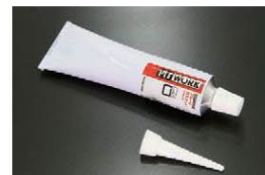
Nissan Seal Packing Black is a liquid gasket

that can be used for engine assembly. After drying, it forms a rubbery, elastic film with excellent heat and oil resistance.