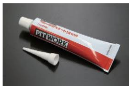
Nissan Seal Packing, Bengara (red iron oxide)

liquid gasket, can be used for assembling engines, transmissions, and differentials. It begins to harden approximately 5 minutes after application.