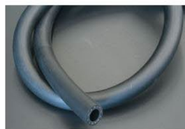
12φ pressure-resistant, oil-resistant rubber hose Oil-resistant rubber hose suitable for high-pressure applications