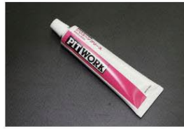
Nissan Silicone Grease

A convenient spray-type oil for preventing rust during storage of camshafts, crankshafts, connecting rods, cylinders, and other components.