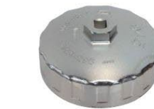
Cup-type oil filter wrench

Part Number: AVSA-080 Compatibility: 18RG Price : ¥2,980 *Filter diameter: 80φ