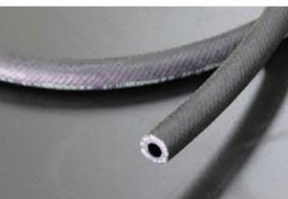
8mm inner diameter fuel rubber hose (high pressure compatible for fuel injection vehicles)