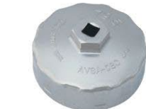
Cup-type oil filter wrench

Part Number: AVSA-092 (Updated 2025.4.13) Compatibility: L20-L28, FJ20 Price : ¥3,300 *Filter diameter: 93φ