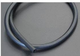
4mm Vacuum Hose

• Heater hose with an inner diameter of 16mm ¥1,700 • Heater hose with an inner diameter of 19mm ¥2,000