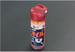
Oil spray (220ml) ¥800

A powerful cleaner that easily removes stubborn oil stains from the inside and outside of Solex and Weber carburetors.