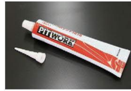
Nissan Seal Packing Gray

Liquid gasket for use in engine, transmission, and differential assembly. Begins to harden approximately 30 minutes after application.