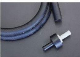
Master cylinder hose & check valve

Part Number: AY100-TY014 Compatibility: 4AG, 3SG Price : ¥1,000