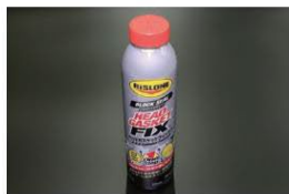
Rison Ultra-Strong Water Leak Repair Agent Head Gasket Fix

Leak Stop Agents / Sealants / Filters & Wrenches / Various Rubber Hoses / Others