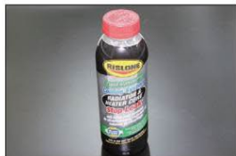
Rison Ultra-Powerful Water Leak Repair Agent for Radiators & Heater Cores - Stop Leaks

*For water leaks from radiators and heater cores