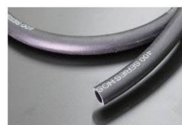
11.5mm inner diameter fuel rubber hose (for carburetor vehicles)