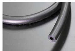
8mm inner diameter fuel rubber hose