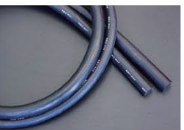
General-purpose heater hose (wall thickness 4mm, length 1m)

Part Number: 31D003 Size: Inner Diameter 15φ, Outer Diameter 22φ Suitable for: L-shaped 2TG, 18RG Price : ¥1,000/1m