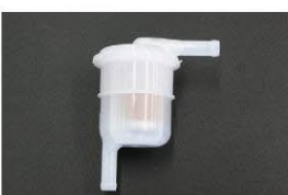
General-purpose fuel filter

Part Number: 16400-0W010 Compatibility: FJ20 Injection Vehicles Price : ¥6,070