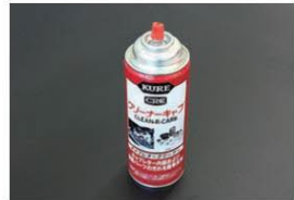
Carburetor Cleaner (420ml) ¥1,200

Ideal for cleaning engine parts and brake components. Fast-drying formula prevents water droplets from sticking to parts.