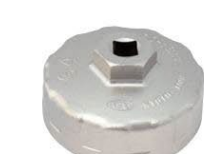
Cup-type oil filter wrench

Part Number: AVSA-080 (Updated 2025.4.13) Compatibility: A12-A15, U20, H20 Price : ¥2,980 *Filter diameter: 80.5φ