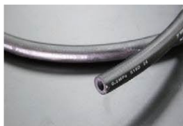
9mm inner diameter fuel rubber hose