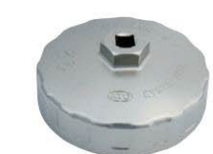
Cup-type oil filter wrench

Part Number: AY100-TY023 Compatibility: 2TG, 3TG, 2T, 3T Price : ¥1,400