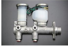
KHC130 Brake master cylinder size: 7/8 (Nissan genuine Nabco) Compatible with: Rear drum vehicles (L20) (75.10-80.10) Price: ¥79,000