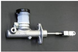
5/8 clutch master cylinder 5/8 clutch master cylinder (Universal type) Compatible with: S30, GC110, C130, 510 Price: ¥12,900