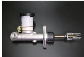
5/8 clutch master cylinder Compatible with: SR311 SP311 Size: 5/8 Price: ¥23,000