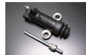
SR311 Standard Lathe Cylinder Compatible with: All SR311/SP311 (late model) Size: 3/4 (manual adjustment) Price: ¥10,680