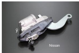
Standard Wheel Cylinder Compatible with: GC10, GC110, 510 Price: ¥47,000/each