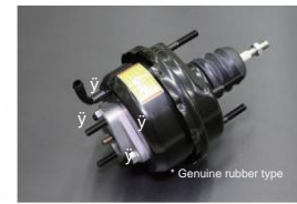
GC110 early model master back size: outer diameter 143mm (claw part) *Can be used with Hakosuka by using spacer Price: ¥76,800