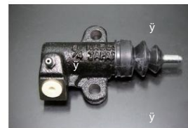
Standard release cylinder FJ20 Standard release cylinder Compatible with: All FJ20 vehicles Size: 3/4 (automatic adjustment) Price: ¥6,000