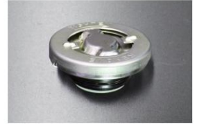
Brake master cylinder cap Part number: K2401 Compatible with: S30, S31, GC10-GC210, KHC130, P330, etc. Price: ¥2,310