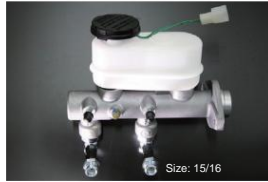
S130 Brake Master Cylinder (for later right-hand drive vehicles) Fits: 81.10-83.8 (L20/L28) Price: ¥49,000 *The pipe mounting position is 6cm lower than standard.