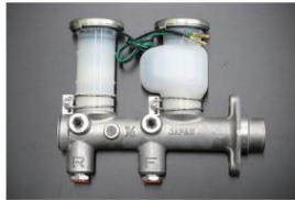
GC210 Brake master cylinder size: 7/8 (Nissan genuine Nabco) Compatible with: Rear drum vehicles (L20E) (77.8-81.7) Price: ¥79,000