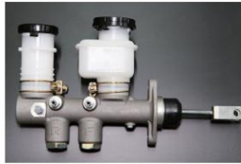
SR311 Brake master cylinder size: 3/4 Fits: SR311, SP311 (67.5-70) Price: 59,000 yen *For high drive vehicles, replace the current bush rod. For left-hand drive vehicles, it is bolt-on.