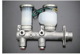
GC110 Brake master cylinder size: 7/8 (Nissan genuine Nabco) Compatible with: GC110 late model, GC111 (rear drum 75.10-77.7) Price: ¥79,000