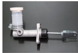
5/8 clutch master cylinder Compatible with: GC210, GC211 (for GT, GTX) Size: 5/8 Price: ¥11,000