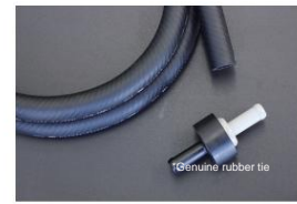
Master back hose & check valve *Universal check valve ¥3,910 *Universal master back hose ¥4,610 (inner diameter 9mm x 1.5M)