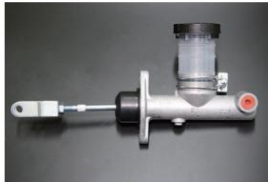
5/8 clutch master cylinder Compatible with: GC10, KGC10 (for GT, GTX) Size: 5/8 *Clevis must be replaced with genuine Price: ¥15,000