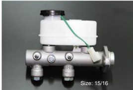
S130 Brake Master Cylinder (for later left-hand drive vehicles) Fits: 81.10-83.8 (L20E) 81.10-83.8 (L28E) Price: ¥42,000