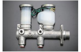
S30 Brake master cylinder size: 7/8 (Nissan genuine Nabco) Compatible with: S30, S31 (75.8-78.9) Price: ¥79,000