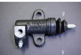
L-type 3/4 release cylinder assembly Part number: 30620-U7001-S Size: 3/4 (single seal type) Applicable to: All L-type vehicles (automatic adjustment type) Price: ¥5,930