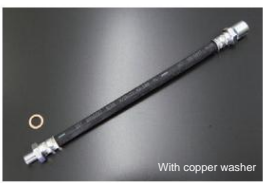
GC10, KPGC10 genuine clutch hose - Total length: 260mm (including threaded part) *Compatible with: GC10, KGC10, KPGC10 *Price: ¥2,470