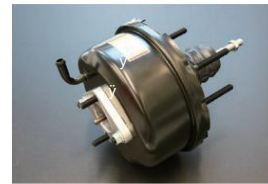
This is a large size for the late GC110 Master Back . (162) If you attach it to the early model, the braking power will increase by 40%. *GC110 can be installed with body modification and spacers.