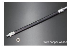
SR311/SP311 genuine clutch hose *Total length: 275mm (including thread) *Compatible with: All SR311/SP311 models *Price: ¥4,020