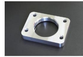
Master back spacer A large-capacity master bag from the late GC110 Used when installing on GC10 and early GC110 Price: ¥5,000