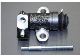
Manual adjustment 3/4 release cylinder FJ20 Standard release cylinder Compatible with: GC10/S30 early model Size: 3/4 Price: ¥8,580