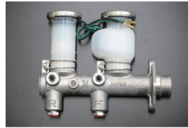
P330 Brake master cylinder size: 7/8 (Nissan genuine Nabco) Compatible with: Rear drum vehicles (L20/L28) (75.6-79.5) Price: ¥79,000