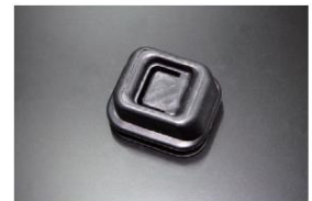
SR311 clutch fork boots Compatible with: All SR311/SP311 (late model) *For 5-speed transmission Price: ¥4,000