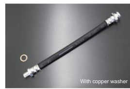
S30, S31, PS30 genuine clutch hose SR311/SP311 genuine clutch hose *Total length: 230mm (including thread) *Compatible with: S30, S31, PS30 *Price: ¥3,260