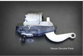
7/8 Large Capacity Wheel Cylinder Compatible with: GC10, GC110, 510 Price: ¥47,000/each