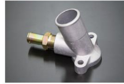
L-shaped 16y water inlet SET (connector mounting part screw type) Price: ¥8,140/SET