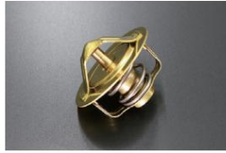
Genuine thermostat 82 degrees Compatibility: L type, FJ20, A type, S20, U20 G7, R16 Price: ¥1,580