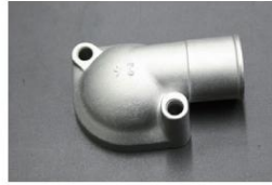
Genuine L-type thermo cover (2 bolts) Fitment: L- type Vehicle model: S30, GC10, etc. Price: ¥2,250