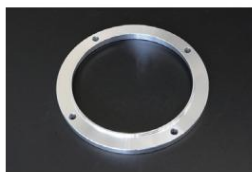
Coupling fan spacer for L6 *Parts that offset the fan 8mm forward Thickness: 8mm Accessories: 4 long bolts Price: ¥4,600