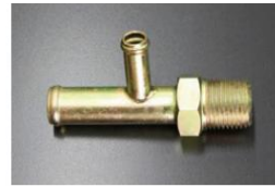
16-10 heater connector for L6 *Standard type for late S30 and S31 models manufactured after August 1975. (Parts to be attached to the water inlet) Reproduction Price: ¥5,000