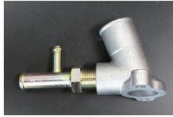
L-type 16-10 water inlet SET (connector mounting part screw type) *Standard type for late S30 and S31 models manufactured after August 1975. Price: ¥9,640/SET