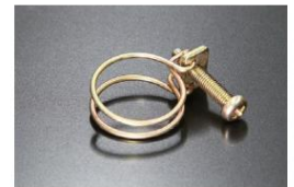
Wire clamp for 16y heater hose, original specifications (reprint) Suitable for: All L-type vehicles, etc. Price: ¥650 * Chromate plating, + round head bolt