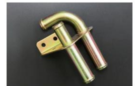
S30 heater hose joint Part number: 27190-N3100 (equivalent) Compatible with: S30, S31 (1973.09-) Price: ¥18,000 *Parts that bypass the interior and engine compartment