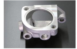
L-type STD thermo housing Compatible with: One-cab, SU- cab vehicles Models: S30, GC10, GC110, KHC130 Price: ¥2,770 *1/4 size water outlet included