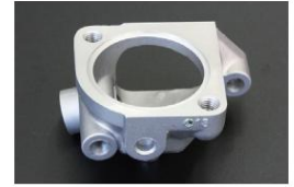
L-type simple thermo housing A neat type with no extra sensor outlets other than the water temperature sensor and no water outlet. * Ideal for vehicles with SOLEX, WEBER, and OER installed. Price: ¥1,950