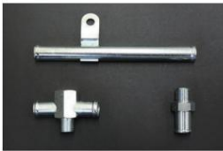
For TA22/TA17 2TG *Heater connector 17-17y fork ¥4,800 *Heater pipe 17y straight ¥4,600 *Heater connector 17y-3/8 ¥1,500