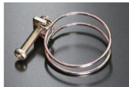
Radiator hose wire clamp, original specifications (reprint) Suitable for: All L-type vehicles, etc. (for 34y hose) Price: ¥850 * Chromate plating, + round head bolt