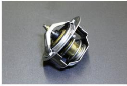
Genuine thermostat 76.5 degrees Compatibility: L type, FJ20, A type, S20, U20 G7, R16 Price: ¥1,820