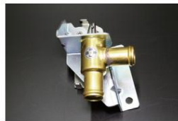
GC10 late model heater cock Compatible with: Price: ¥17,700