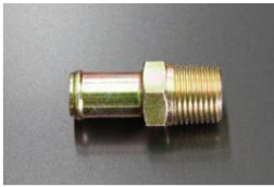
straight for L6 Head heater screw diameter 20.9 Price: ¥3,500