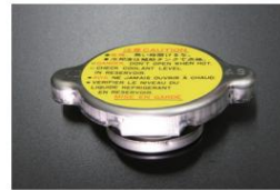
Nissan Genuine Radiator Cap Compatible with: GC10, GC110, GC210 C130, S30, S130 Price: ¥2,690