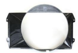
S30 FRP fan shroud Year: S44,10-S49,9 Fits: S30/ HS30 Price: ¥20,000