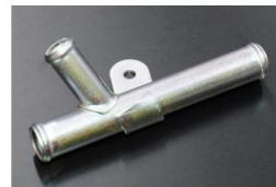
19-16-19 heater connector for L6 (Parts to be attached to the block side) Price: ¥890