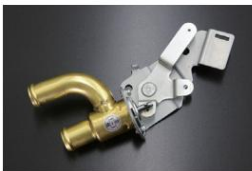
S130 heater tap Compatible with: S130 all years (not compatible with Z-T or automatic air conditioner vehicles) Price: ¥17,700