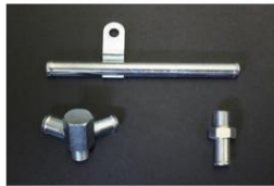
For TE27 2TG *Heater connector 14-17y fork ¥4,800 *Heater pipe 14y straight ¥4,600 *Heater connector 14y-3/8 ¥1,500