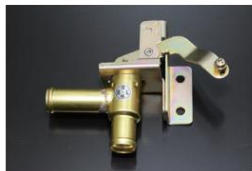
S30 early model heater cock Compatible with: 1969/10-1973/9 Price: ¥17,700