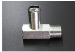
16y-L type head heater connector for L4 (screw size 3/8, screw diameter 16.6) Price: ¥960