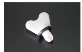
Nissan genuine radiator drain cock Compatibility: S30-S130, GC10-R30 B110-B310, KHC130, etc. Price: ¥590