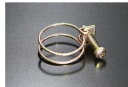
Wire clamp for 19y heater hose, original specifications (reprint) Suitable for: All L-type vehicles, etc. Price: ¥700 * Chromate plating, + round head bolt