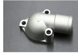
Genuine L-type thermo cover (3 bolts) Fits: L-type Vehicles: S130, GC210, etc. Price: ¥1,520