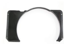
510 FRP fan shroud Year: Compatible with: All 510 models Price: ¥15,000