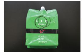
Genuine Nissan Long Life Coolant Fits: All vehicles Capacity: 2 liters (Color: Green) Price: ¥2,100