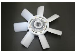
L6 Coupling + fan set Specifications: 385mm 7 blades Compatible with: All L-type vehicles Price: ¥31,950/SET (Coupling ¥22,800 Fan ¥9,150)