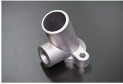
L-type 1/2 water inlet (connector mounting part screw type) *Standard type for late S30 and S31 models manufactured after August 1975. Price: ¥4,640