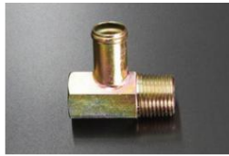
16y-L type for L6 16y connector (screw size 1/2, screw diameter 20.9) (screw size 1/2, diameter 16.6) Price: ¥4,500