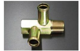
Head heater connector for S130Z (16y fork - screw size 1/2 screw diameter 20.9) Reprint price: ¥6,000