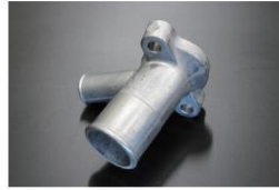
L-type 19y water inlet (Heater hose port 19y) *Standard type for S30, GC110, C130, etc. from 1973 to 1975. *Use when you want to connect the heater hose directly. Price: ¥1,220