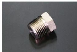
L-type 1/2 cylinder plug Motor: L20.L24.L26.L28 Compatible with: Cylinder block and head Price: ¥950 *Thread diameter 20.9 (stainless steel)