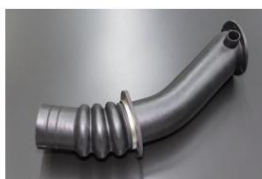
S30.240Z Fuel tank hose Compatible with: S30, HS30 (~ 74.10まで) Price: ¥12,800