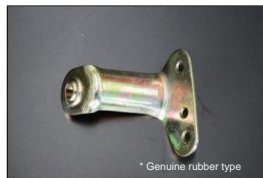
S30 Accelerator Link Support Comes with a ball joint that fits the 8mm shaft linkage perfectly Price: To be determined