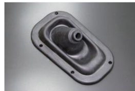
Price: ¥4,070 *Price change on February 14, 2025