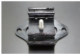
S30 genuine transmission mount Engine: L20, L24, S20 Compatible: S30, PS30 Price: ¥4,870