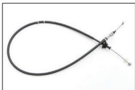
Z31 Early Accelerator Wire Compatible with: Z31 (RB20) ~ 1985.10 (equivalent to 18200-11P00) Price: ¥16,000 *Not for cars with auto cruise