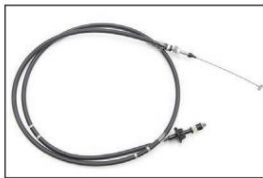
Z31 late model accelerator wire Compatible with: Z31 (RB20) 1985.10- (equivalent to 18201-20P00) Price: ¥16,000