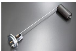
S30 early model fuel tank unit gauge Compatible with: Early S30 Price: ¥153,000