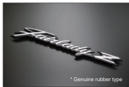
S30 Fairady-Z emblem *For fenders (Nissan genuine metal) Price: ¥19,000/each