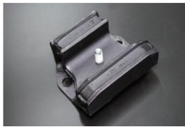
S30 genuine differential mount Engine: L20 Compatible with: S30, S31 Price: ¥6,380