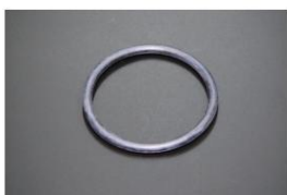
Fuel gauge O-ring Compatible with: S30, SR311, SP311 GC10, GC110, 510, C130, 230, 330 Price: ¥1,240