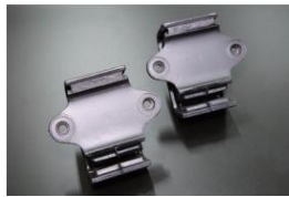
S30, S130 Genuine engine mount set Engine: L20, L24, S20 Compatible: S30, PS30, S130 Price: ¥9,820/SET