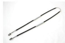
S30 Early model handbrake wire (reproduction product 36543-N3000 equivalent) ¥20,000