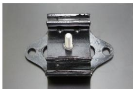
S30 genuine transmission mount

Engine: L20 Compatible with: S30, S31 Price: ¥6,380