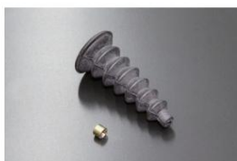
S30 Accelerator Linkage Boots S30 Gear Shift Boots