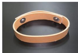
S30 reinforced differential belt

Engine: L20, L24, S20 Compatible: S30, PS30 Price: ¥4,870