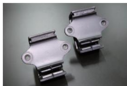
S30, S130 Genuine engine mount set

Engine: L20, L24, S20 Compatible: S30, PS30, S130 Price: ¥9,820/SET