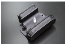
S30 genuine differential mount

Engine: L20, L24, S20 Compatible: S30, PS30, S130 Price: ¥9,820/SET