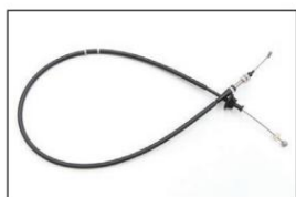
Z31 Early Accelerator Wire

Compatible with: Z31 (RB20) ~ 1985.10 (equivalent to 18200-11P00)