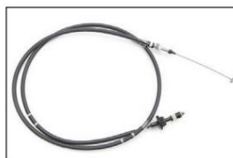
Z31 late model accelerator wire

Price: ¥16,000 *Not for cars with auto cruise