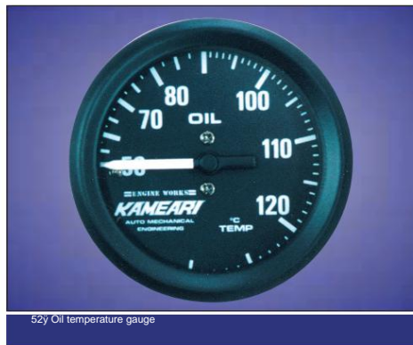
52y Oil temperature gauge

[Specifications] Type ... Mechanical Bourdon type Display ... 0y10kg/cm 2 range Face Black ... Blue plate color ... 52y Illumination Outer diameter