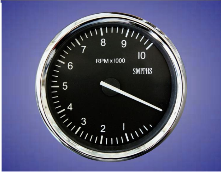
100y Smith Classic Tachometer ¥46,000

[Specifications] Type: Electric Display range: 0 to 10,000 rpm Face plate color: Black Illumination: Colorless Outer diameter: 100y