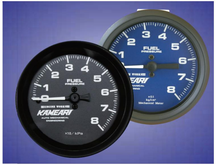
60y Fuel pressure gauge (black & blue) ¥12,000 (reinforced stainless steel mesh hose sold separately)

[Specifications] Type: Electric Display range: 0 to 10,000 rpm Face plate color: Black Illumination: Colorless Outer diameter: 100y