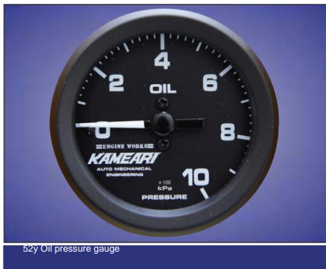
52y Oil pressure gauge

part that is inserted into the middle of the fuel hose and connected to the reinforced stainless steel mesh hose.