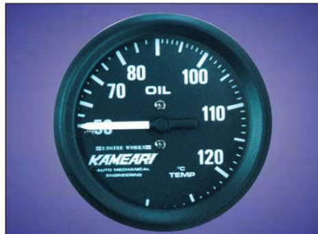
52φ Oil temperature gauge

¥11,000 (Reinforced stainless steel mesh hose sold separately) (Updated 2026.01.08)