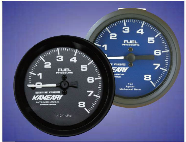
60φ Fuel pressure gauge (black & blue)