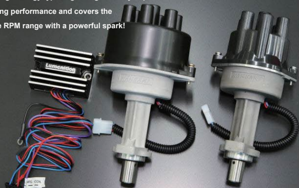
Fixed advance type

This high-energy type engine significantly improves starting performance and covers the entire RPM range with a powerful spark!