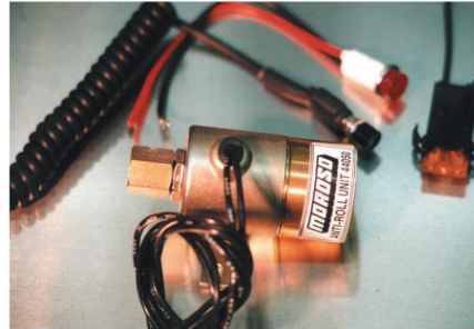
Line lock body