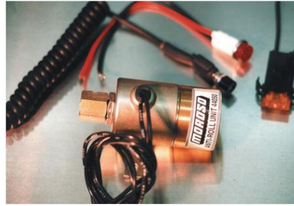
Line lock body