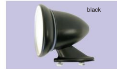
Universal fender mirror (left and right set) 1 set ¥20,000

(Mirror diameter x total length x height) 103 x 125 x 110