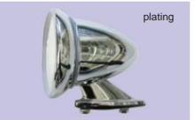
Universal fender mirror (left and right set) 1 set ¥24,000

(Mirror diameter x total length x height) 103 x 125 x 110