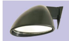
Universal door mirror (left and right set) 1 set ¥24,000

(Mirror height x width x length x projection) 92 x 144 x 101 x 148