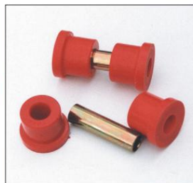
S30 Lower Arm Bush SET S30 Tension Rod Bush SET S30 Stabilizer Bush SET S30 Rear control arm bush SET S30 Mission cross member SET