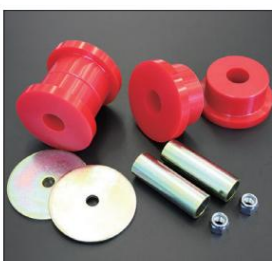
Universal F shock bump stop set GC10 rear shock bush set 510, G610 rear member bush set