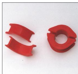
GC10 transmission cross member SET S30 differential carrier bush SET GC10 differential carrier bush SET S30, S130 steering damper S30 rack and pinion bush SET