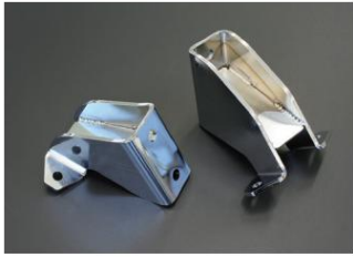
*Chrome plated product

The combination of a 4mm main plate thickness and a 3mm reinforcing plate maintains the high rigidity required for high-powered vehicles. It prevents twisting of the bracket that occurs during sudden acceleration or braking, and reduces unnecessary movement of the engine and transmission.