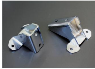
*Chrome plated product

The combination of a 4mm main plate thickness and a 3mm reinforcing plate maintains the high rigidity required for high-powered vehicles. It prevents twisting of the bracket that occurs during sudden acceleration or braking, and reduces unnecessary movement of the engine and transmission.