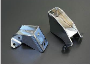
*Chrome plated product

The combination of a 4mm main plate thickness and a 3mm reinforcing plate maintains the high rigidity required for high-powered vehicles. It prevents twisting of the bracket that occurs during sudden acceleration or braking, and reduces unnecessary movement of the engine and transmission.