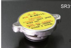
SR311 Reservoir Tank Cap

reproduction of the discontinued radiator cap. It plays an important role in sending coolant to the reservoir tank.