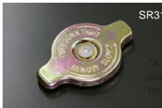
SR311 Radiator cap