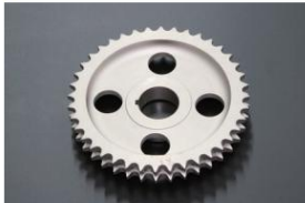
Product number: K13035-25500