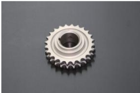
Product number: K13036-25500