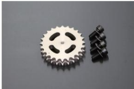
Product number: KS13024-25500