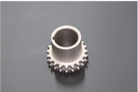
Product number: K13021-20100