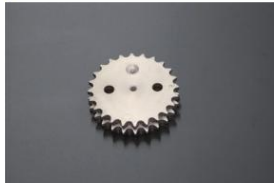
Product number: K13024-25500