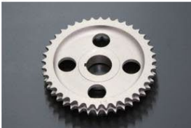
Product number: K13035-25500