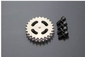
Product number: KS13024-25500