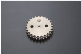
Product number: K13024-25500