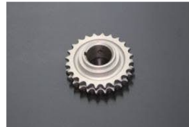
Product number: K13036-25500