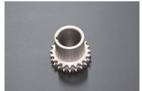
Product number: K13021-20100