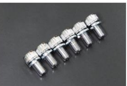
Clutch cover reinforced bolts 6-piece set (Tightening torque: 4.0kg/m 39.2Nym) Suitable for: L6 (225mm), L18, FJ20 (NA) L20B, A type, 2TG, 18RG, 4K Price: ¥1,500

*Corrosion-resistant chrome-plated finish