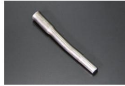
L6 Oil level gauge guide Price: ¥460