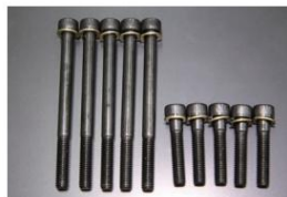
L6 Cam holder reinforcement bolt SET *M8x100, slightly longer to prevent damage to the threads Tightening : 2.5kg/m (24.5Nym) M8x40 Tightening: 2.2kg/m (21.5Nym) Price: ¥2,250