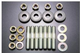
L4 exhaust manifold mounting bolt set *Standard set including genuine stud bolts, yokes, nuts and washers. *L4 SET Price: ¥2,010