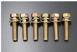
L-shaped intake manifold upper mounting bolt set *7 mark high strength bolt (M8 x 35) (washer built-in type) Price: L6 ¥1,500 (set of 6) L4 ¥1,000 (4-piece set)