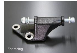
L6 through-type alternator bracket *This is a bolt loosening prevention item for tuning cars. Chromoly reinforced bolts (M10 x 130) included *Installation... Alternator hole enlargement required Price: ¥7,100