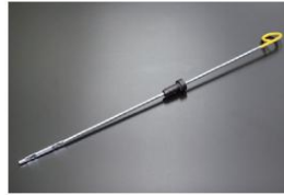
S130 Oil level gauge *Distance from top to H: 179mm H to L: 19mm Price: ¥670