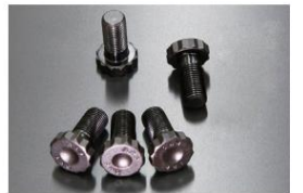
L4 ARP reinforced flywheel bolt *Product to prevent bolts from loosening on tuning cars. Tightening torque: 18.5kg/m (181.4 Nym) Price: ¥10,000