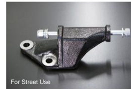
L6 through-type alternator bracket *This is a bolt loosening prevention item for tuning cars. Chromoly reinforced bolts (M8 x 130) included *Installation: Bolt-on Price: ¥6,400