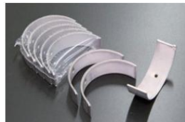
VG30DET connecting rod metal Compatible with: L32 narrow connecting rod Grade: #0 #1 #2 Price: ¥2,040 / 1 piece