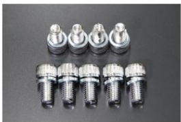
Clutch cover reinforced bolts 9-piece set (Tightening torque: 4.0kg/m 39.2Nym) Suitable for: L6 (240mm) Kameari large diameter clutch, FJ20ET, SR20, RB20 Price: ¥2,250

*Corrosion-resistant chrome-plated finish