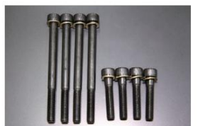
L4 Cam holder reinforced bolt SET * M8x100, slightly longer to prevent damage to the threads Tightening: 2.5kg/m (24.5Nym) M8x40 Tightening: 2.2kg/m (21.5Nym) Price: ¥1,800