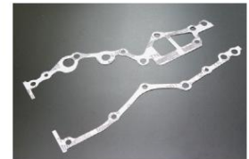
L20B Front cover G/K * Set of left and right Price: ¥1,340/SET