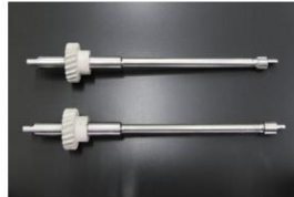
L6 spindle gear Late model: KAMEARI products (top photo) Price: ¥15,000 Early model: Nissan genuine parts (bottom photo) Price: ¥10,000