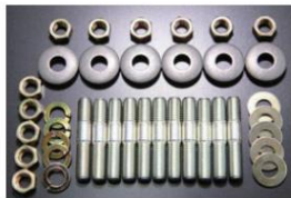
L6 exhaust manifold mounting bolt set *Standard set including genuine stud bolts, yokes, nuts and washers. *L6 SET Price: ¥3,130