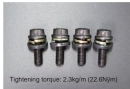
L-shaped chain guide reinforced bolt set * Reinforced chrome molybdenum flange bolt (M6 x 18) Spring washer M6x14x12.3 flat washer Price: ¥800/SET