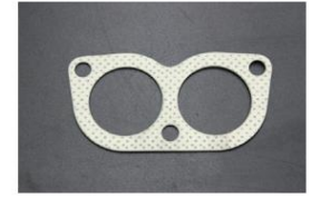
STD Glasses Muffler Gasket Compatible with: GC10/S30 early model *For genuine exhaust Price: ¥800