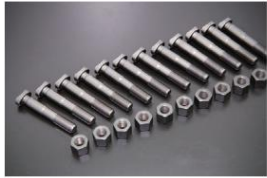
L-type genuine connecting rod bolt and nut set Engine: L20, L24, L28, L14, L16, L18 Compatible: All L-type vehicles with 9mm size Price: L6 ¥7,200 L4 ¥4,800