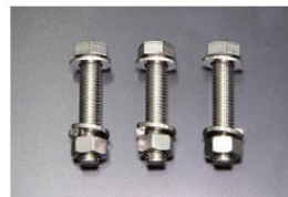
L6 Octopus flange bolt set (Material: Stainless steel SUS304) M8x40 muffler mounting bolt Price: ¥1,200/SET

*Corrosion-resistant chrome-plated finish