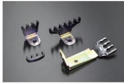
L6 Plug Cord Holder Set (Standard) Fitment: Support is for 2-bolt thermo cover Price: ¥8,000/set