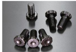
L6 ARP reinforced flywheel bolt *This is a product to prevent bolts from loosening on tuning cars. Tightening torque: 18.5kg/m (181.4 Nym) Price: ¥12,000