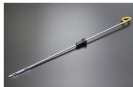
S130 Oil level gauge *Distance from top to H: 179mm H to L: 19mm Price: ¥670