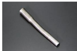
L6 Oil level gauge guide Price: ¥460