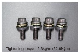
L-shaped chain guide reinforced bolt set Tightening torque: 2.3kg/m (22.6Nym) * Reinforced chrome molybdenum flange bolt (M6 x 18) Spring washer M6x14x12.3 flat washer Price: ¥800/SET