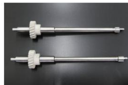
L6 spindle gear Late model: KAMEARI products (top photo) Price: ¥15,000 Early model: Nissan genuine parts (bottom photo) Price: ¥20,000