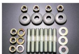
L4 exhaust manifold mounting bolt set *Standard set including genuine stud bolts, yokes, nuts and washers.