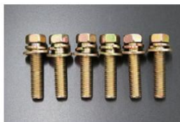
L-shaped intake manifold upper mounting bolt set *7 mark high strength bolt (M8 x 35) (washer built-in type) Price: L6 ¥1,500 (set of 6) L4 ¥1,000 (4-piece set)