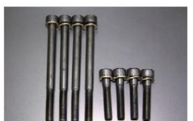
L4 Cam holder reinforced bolt SET * M8x100, slightly longer to prevent damage to the threads Tightening: 2.5kg/m (24.5Nym) M8x40 Tightening: 2.2kg/m (21.5Nym) Price: ¥1,800