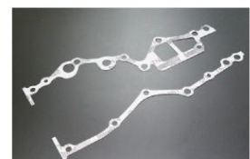
L20B Front cover G/K * Left and right set Price: ¥1,340/SET