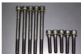
L6 Cam holder reinforcement bolt SET * M8x100, slightly longer to prevent damage to the threads Tightening: 2.5kg/m (24.5Nym) M8x40 Tightening: 2.2kg/m (21.5Nym) Price: ¥2,250