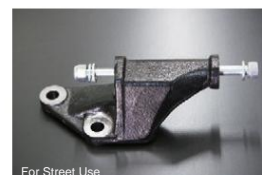
L6 through-type alternator bracket *This is a bolt loosening prevention item for tuning cars. Chromoly reinforced bolts (M8 x 130) included *Installation: Bolt-on Price: ¥6,400