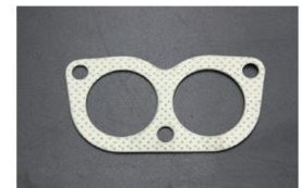
STD Glasses Muffler Gasket Compatible with: GC10/S30 early model *For genuine exhaust Price: ¥800