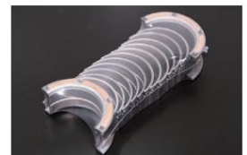
L6 OEM 0.5 under main metal SET Engine: L20, L24, L28 Compatible: Journal is 0.5 under and thrust is STD type Price: ¥15,700