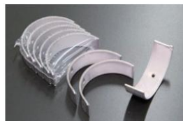
VG30DET connecting rod metal Compatible with: L32 narrow connecting rod Grade: #0 #1 #2