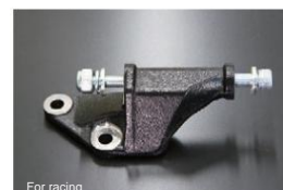
L6 through-type alternator bracket *This is a bolt loosening prevention item for tuning cars. Chromoly reinforced bolts (M10 x 130) included *Installation... Alternator hole enlargement required Price: ¥7,100