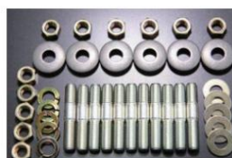
L6 exhaust manifold mounting bolt set *Standard set including genuine stud bolts, yokes, nuts and washers.