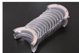
L6 genuine 0.25 under main metal set Engine: L20, L24, L28 Compatible: Journal is 0.25 under and thrust is STD type Price: ¥15,700