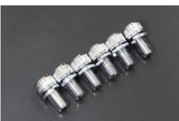
Clutch cover reinforced bolts 6-piece set (Tightening torque: 4.0kg/m 39.2Nym) Suitable for: L6 (225mm), L18, FJ20 (NA) L20B, A-type, 2TG, 18RG, 4K Price: ¥1,500

*Corrosion-resistant chrome-plated finish