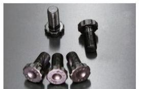
L6 ARP reinforced flywheel bolt *Product to prevent bolts from loosening on tuning cars. Tightening torque: 18.5kg/m (181.4 Nym) Price: ¥10,000