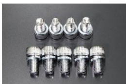
Clutch cover reinforced bolts 9-piece set (Tightening torque: 4.0kg/m 39.2Nym) Suitable for: L6 (240mm) Kameari large diameter clutch FJ20ET, SR20, RB20 Price: ¥2,250

*Corrosion-resistant chrome-plated finish