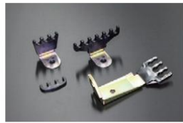
L6 Plug Cord Holder Set (Standard) Fitment: Support is for 2-bolt thermo cover Price: ¥8,000/set