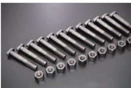
L-type genuine connecting rod bolt and nut set Engine: L20, L24, L28, L14, L16, L18 Compatible: All L-type vehicles with 9mm size Price: L6 ¥7,200 L4 ¥4,800