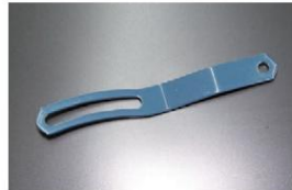
L6 alternator adjustment stay Fits: L20, L24, L26, L28