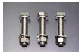
L6 Octopus flange bolt set (Material: Stainless steel SUS304) * M8x40 muffler mounting bolt Price: ¥1,200/SET

*Corrosion-resistant chrome-plated finish