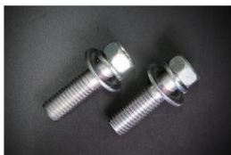
Kameari starter mounting bolt set Fits: L4, L6, U20, S20 *7 mark Nissan genuine bolt (M10 x 35) (washer built-in type) Price: ¥440 / 2 bottles SET