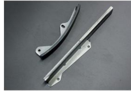
L-shaped chain guide L6 curved chain guide ¥2,260 L4 curved chain guide ¥1,050 L4L6 straight guide ¥960