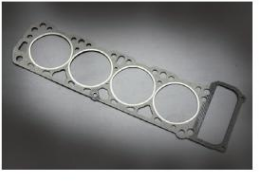
L18 STD head gasket Fits: L18 Vehicle: 510 etc. Price: ¥4,950 (aftermarket)