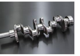
L16 modified L18 78mm crank ¥Genuine modified crankshaft Processing details: Bending correction, single key processing, precision balancing Price: ¥126,000