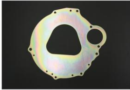
L-shaped back plate *For cars with manual transmission up to S52¥1,900