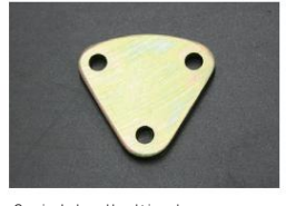
Genuine L-shaped head triangular cover Fits: L20, L24, L26, L28 (Fuel pump hole cover) Price: ¥1,050