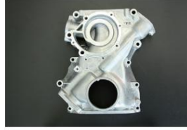
L-shaped front cover ¥9,400 *2 water pump knock pins included