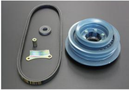
L6 Cooler Pulley Kit ¥21,530/KIT (single item price) Crank Pulley ¥18,700 Indicator #830 Washer #460 Pillar #340 Pillar Bolt #150 Fan Belt (AY160-VA355) ¥1,050