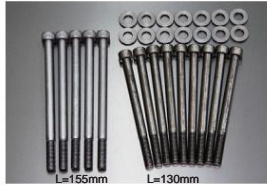
L-type Chromoly Head Bolt Set Applicable to: All L-type vehicles *Strong washers included Price: ¥10,000/L6 set ¥7,200/L4 set *Wrench size: M8 Please use a hex wrench