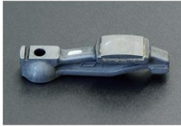
L-type Nissan genuine rocker arm •L4 set ¥118,400 •L6 set ¥177,600 •Single item ¥14,800