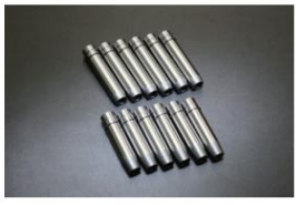
L-type STD valve guide Compatible with: L20-L28 L14-L18 Specifications: Inner and outer diameter STD (inner diameter fine adjustment required) Price: L6 ¥14,400/SET L4 ¥9,600/SET