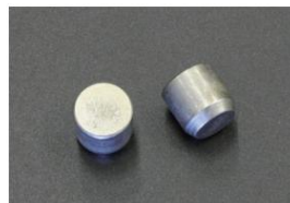
L-shaped oil gallery plug (2 pieces used at the front and rear of the cylinder block) ¥220/1 piece