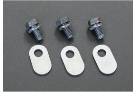
L6 Cam Holder Oil Shower Plug ¥1,200/SET *Oil passage plug required when installing a center oiling cam on an early L-type engine.