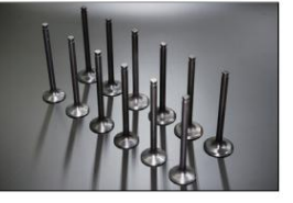
L20 Standard Valve Compatible: L20 Size: IN: 38¥ EX: 33¥ Price: IN ¥3,000/each EX¥3,000/each