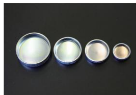
Cylinder block flanged plug 50¥ ¥250 40¥ ¥250 35¥ ¥250 25¥ ¥250