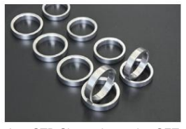
L24 STD Sintered seat ring SET Compatible with: L24 (240Z) Valve size: IN42¥ EX33¥ Price: ¥24,000 (IN,EX 1 set) *Oversized specification that can correct corrosion