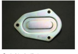
Genuine L-type head front cover Suitable for: L20 to L28 L14 to L18 Price: ¥340