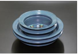
L4 genuine crank pulley triple pulley type (3rd stage can be removed) Engine: L14,L16,L18 Compatible with: All L4 vehicles Price: ¥14,400