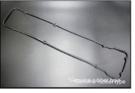
L6 Plastic Tappet Cover Rubber Gasket Engine: L20 Compatible: L20 late model plastic tappet cover Price: ¥8,000