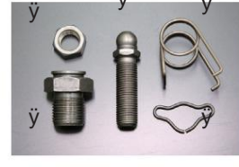
L-type pivot set ¥1,290 /set ¥ Pivot adjust screw (single) Rocker bush ¥220 ¥ Pivot bush ¥410