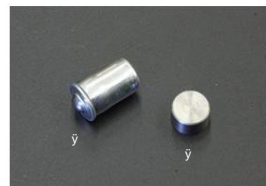
L-type oil relief valve & plug ¥Relief valve ¥350 *Standard equipment, relief circuit valve for when the filter becomes clogged ¥Relief plug ¥800 *Relieves pressure even at high oil pressure and high revolutions without causing relief.