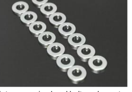
L-type genuine head bolt washer set Engine: L20, L24, L28, L14, L16, L18 Compatible with: All L-type vehicles Price: L6 ¥3,080 L4 ¥2,200