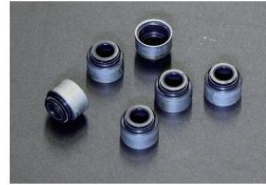
L-type low head valve oil seal ¥280/each This type is 1.3mm lower than the genuine product. It increases the distance to bottoming out and increases the valve lift.