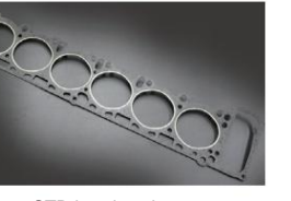
L20 STD head gasket Fits: L20 Vehicles: GC10-HR30, S30, KC130, etc. Price: ¥5,800 (aftermarket product) ¥18,100 (genuine product)