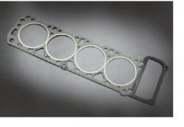
L16.L14 STD head gasket Fits: L16, L14 Vehicle: 510, etc. Price: ¥4,950 (aftermarket product)