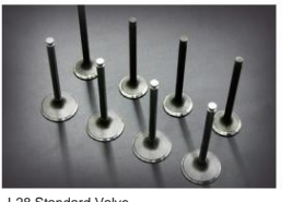
L28 Standard Valve Compatible: L28 (N42) Size: IN: 44¥ EX: 35¥ Price: IN ¥2,280/each EX¥3,200/each