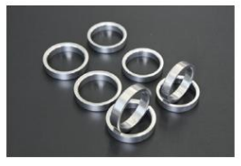
L18 STD Sintered seat ring SET Compatible with: L18, L20B Valve size: IN42¥ EX35¥ Price: ¥16,000 (for 1 IN,EX) *Oversized specification that can correct corrosion