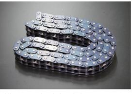
Nissan genuine timing chain Compatible with: L20-L28 L14-L18 Price: ¥15,600