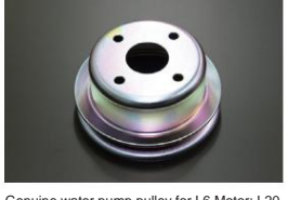
Genuine water pump pulley for L6 Motor: L20 to L28 Suitable for: Outer diameter 116¥ 13mm belt Price: ¥5,620