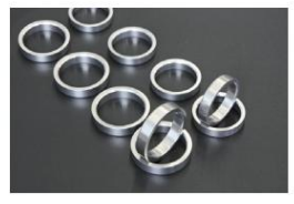
L20 STD Sintered seat ring SET Compatible with: All L20 vehicles Valve size: IN38¥ EX33¥ Price: ¥24,000 (IN,EX 1 set) *Oversized specification that can correct corrosion