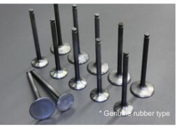
L24 Standard Valve Compatible: L24/L26 (E88) Size: IN: 42¥ EX: 33¥ Price: ¥3,000/each ¥36,000/each