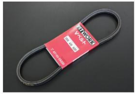
L-shaped fan belt (standard product) •AY160-VA330 ¥950 •AY160-VA335 ¥1,050 •AY160-VA340 ¥1,050 •AY160-VA345 ¥1,050