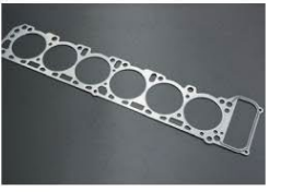
STD head gasket •L28 (Nissan genuine product) ¥11,600 •L24/L26 (aftermarket) ¥6,500 (Updated 2026.4.6)