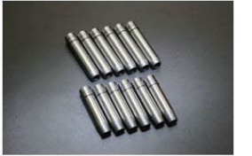
L-type STD valve guide Compatible with: L20-L28 L14-L18 Specifications: inner and outer diameter STD (inner diameter fine adjustment required) Price: L6 ¥14,400/SET L4 ¥9,800/SET