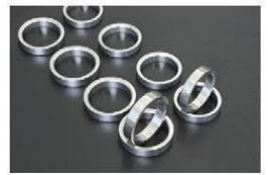
L28 STD Sintered seat ring SET Compatible with: All L28 vehicles Valve size: IN:44ΦEX:35Φ Price: 24,000 (IN EX 1 set) *Oversized type designed to compensate for corrosion damage.