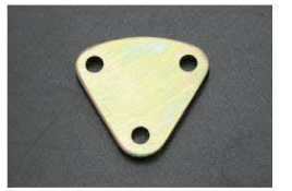
Genuine L-shaped head triangular cover Compatibility: L20, L24, L26, L28 (Fuel Pump Hole Cover) Price: ¥1,100 (Updated 2026.4.6)