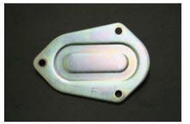
Genuine L-type head front cover Compatibility: L20-L28 L14-L18 Price: ¥360 (Updated 2026.4.6)