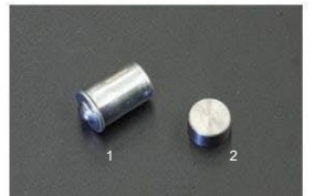
L-type Oil Relief Valve & Plug (Updated 2026.4.6) 1.Relief valve ¥370 2.Relief plug ¥800 *A relief-circuit valve that operates when the filter becomes clogged (standard equipment). *Ensures the oil continues to pass through the filter without activating relief, even under high oil pressure and high RPM.