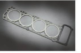
L16.L14 STD head gasket Fits: L16, L14 Vehicle: 510, etc. Price: ¥4,950 (aftermarket)