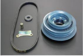
L6 Cooler Pulley Kit ¥42,160/KIT (Updated 2026.4.21) (single price) Crank pulley ¥39,100 Indicator ¥970 Washer ¥480 Support ¥500 Support bolt ¥160 Fan belt (AY160-VA355) ¥1,050