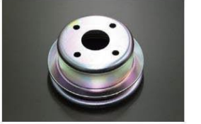
Genuine water pump pulley for L6 Motor: L20-L28 Compatibility: Outer diameter 116Φ for 13mm belt Price: ¥5,870 (Updated 2026.04.06)