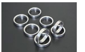
L14 STD Sintered seat ring SET Compatible with: L14 Twin carb Valve size: IN:42ΦEX:33Φ Price: ¥16,000 (IN EX 1 set) *Oversized type designed to compensate for corrosion damage.