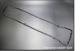
L6 Plastic Tappet Cover Rubber Gasket Engine: L20 Compatible: L20 late model plastic tappet cover Price: ¥8,000