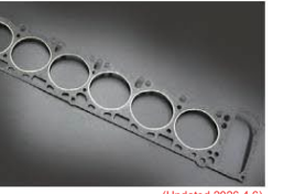
L20 STD head gasket (Updated 2026.4.6) Aftermarket L20 Head Gasket ¥5,800 (Compatible cylinders: E30 and Y70) Nissan Genuine L20 Head Gasket: ¥19,000 (Compatible cylinders: E30 / Y70 / 14S)