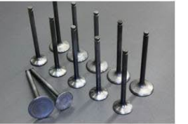
L24 Standard Valve Compatible: L24(L26 (E88) Size: IN:42Φ EX:33Φ Price: ¥3,000/each ¥36,000/each