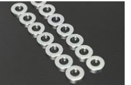
L-type genuine head bolt washer set Engine: L20, L24, L28, L14, L16, L18 Compatible with: All L-type vehicles Price: L6 ¥3,220 L4 ¥2,300 (Updated 2026.4.6)