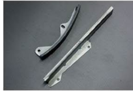
L-shaped chain guide (Updated 2025.10.30) L6 curved chain guide ¥5,940 L4 curved chain guide ¥5,940 L4L6 straight guide ¥5,000