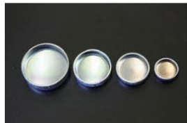
Cylinder block flanged plug (Updated 2026.4.6) 50Φ×260 40Φ×250 35Φ×250 25Φ×260