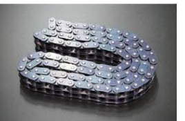
Genuine Nissan Timing Chain Compatible with: L20-L28 L14-L18 Price: Discontinued (Updated 2026.02.08)