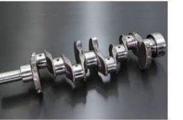
L16 modified L18 78mm crank (updated 2026.4.9) *Genuine processed crankshaft Processing details: Bending correction, single key processing, precision balancing Price: ¥127,300