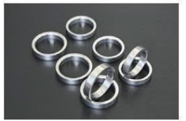
L18 STD Sintered seat ring SET Compatible with: L18, L20B Valve size: IN:42ΦEX:35Φ Price: ¥16,000 (IN EX 1 set) *Oversized type designed to compensate for corrosion damage.