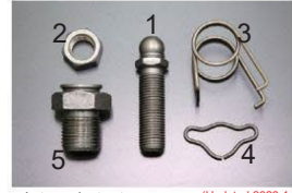
L-type pivot set (Updated 2026.4.6) (single) 1.Pivot adjust screw ¥340 2.Pivot lock nut ¥340 3.Rocker spring ¥120 4.Pivot retainer ¥120 5.Pivot bush Discontinued

Engine: L14, L16, L18 Compatible with: All L4 vehicles Price: Discontinued (Updated 2026.02.08)