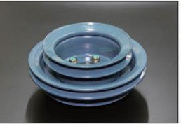
L4 genuine crank pulley triple pulley type (3rd stage can be removed)

Engine: L14, L16, L18 Compatible with: All L4 vehicles Price: Discontinued (Updated 2026.02.08)