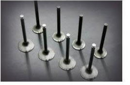
L28 Standard Valve (Updated 2026.4.6) Compatible: L28 (N42) Size: IN: 44ΦEX: 35Φ Price: IN: ¥2,300/each EX: ¥3,350/each