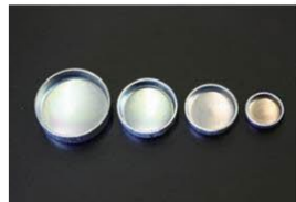
Cylinder block flanged plug 50Φ×260 (Updated 2026.4.6) 40Φ×250 35Φ×250 25Φ×260