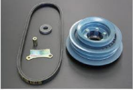
L6 Cooler Pulley Kit ¥42,060/KIT (Updated 2026.4.6) (single price) Crank pulley ¥39,000 Indicator ¥970 Washer ¥480 Support ¥500 Support bolt ¥160 Fan belt (AY160-VA355) ¥1,050