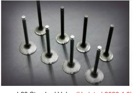
L28 Standard Valve (Updated 2026.4.6) Compatible: L28 (N42) Size: IN: 44ΦEX: 35Φ Price: IN: ¥2,300/each EX: ¥3,350/each