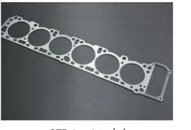
STD head gasket •L28 (Nissan genuine product) ¥11,600 •L24/L26 (aftermarket) ¥6,500 (Updated 2026.4.6)