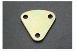
Genuine L-shaped head triangular cover

Compatibility: L20-L28 L14-L18 Price: ¥360 (Updated 2026.4.6)