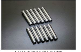
L-type STD valve guide Compatible with: L20-L28 L14-L18 Specifications: inner and outer diameter STD (inner diameter fine adjustment required) Price: L6 ¥14,400/SET L4 ¥9,800/SET