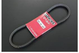
L-shaped fan belt (standard) •AY160-VA330 ¥950 •AY160-VA335 ¥1,050 •AY160-VA340 ¥1,050 •AY160-VA345 ¥1,050