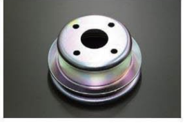
Genuine water pump pulley for L6

Compatibility: L20, L24, L26, L28 (Fuel Pump Hole Cover) Price: ¥1,100 (Updated 2026.4.6)