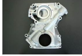
L-shaped front cover (Updated 2026.4.6) *2 water pump knock pins included ¥9,840