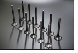
L20 Standard Valve Compatible: L20 Price: IN: ¥3,000/each Size: IN: 38ΦEX: 33Φ EX: ¥3,000/each