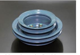
L4 genuine crank pulley triple pulley type (3rd stage can be removed)

Engine: L14, L16, L18 Compatible with: All L4 vehicles Price: Discontinued (Updated 2026.02.08)