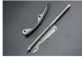
L-shaped chain guide (Updated 2025.10.30) L6 curved chain guide ¥5,940 L4 curved chain guide ¥5,940 L4L6 straight guide ¥5,000