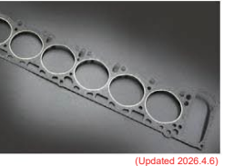
L20 STD head gasket (Updated 2026.4.6) Aftermarket L20 Head Gasket ¥5,800 (Compatible cylinders: E30 and Y70) Nissan Genuine L20 Head Gasket: ¥19,000 (Compatible cylinders: E30 / Y70 / 14S)