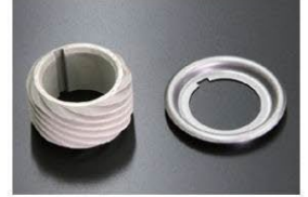
L-type oil pump gear (image on the left) (Updated 2026.4.6) ¥2,950 L-type oil thrower (image on the right) ¥110