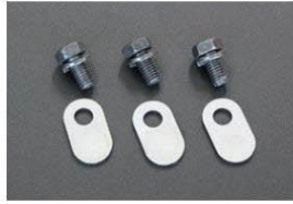
L6 Cam Holder Oil Shower Plug ¥1,500/SET Oil passage plugs required when installing a center-oil-feed cam. (Updated 2025.4.6)