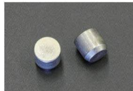
L-shaped oil gallery plug (2 pieces used at the front and rear of the cylinder block) (Updated 2026.4.6) ¥230 /1piece