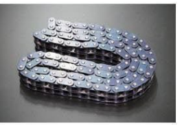
Genuine Nissan Timing Chain

Compatible with: L14 Twin carb Valve size: IN:42ΦEX:33Φ Price: ¥16,000 (IN EX 1 set) *Oversized type designed to compensate for corrosion damage.