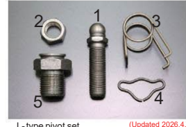
L-type pivot set (Updated 2026.4.6) (single) 1.Pivot adjust screw ¥340 2.Pivot lock nut ¥340 3.Rocker spring ¥120 4.Pivot retainer ¥120 5.Pivot bush Discontinued

Engine: L14, L16, L18 Compatible with: All L4 vehicles Price: Discontinued (Updated 2026.02.08)