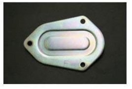
Genuine L-type head front cover

Engine: L20, L24, L28, L14, L16, L18 Compatible with: All L-type vehicles Price: L6 ¥3,220 L4 ¥2,300 (Updated 2026.4.6)