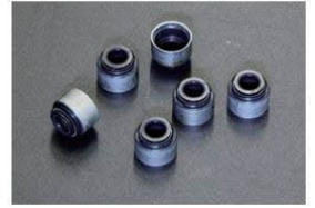
L-type low head valve oil seal ¥280/each A type that is 1.3 mm shorter in height than the genuine part. It increases the clearance before bottoming out, allowing for greater valve lift.