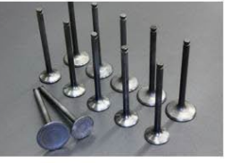
L24 Standard Valve Compatible: L24(L26 (E88) Size: IN:42Φ EX:33Φ Price: ¥3,000/each ¥36,000/each

*Genuine processed crankshaft Processing details: Bending correction, single key processing, precision balancing Price: ¥127,300