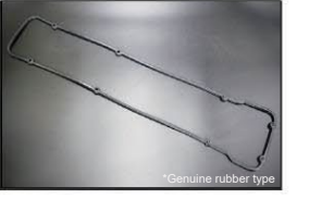
L6 Plastic Tappet Cover Rubber Gasket Engine: L20 Compatible: L20 late model plastic tappet cover Price: ¥8,000

Fits: L16, L14 Vehicle: 510, etc. Price: ¥4,950 (aftermarket)