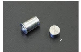
L-type Oil Relief Valve & Plug (Updated 2026.4.6) 1.Relief valve ¥370 2.Relief plug ¥800 *A relief-circuit valve that operates when the filter becomes clogged (standard equipment). *Ensures the oil continues to pass through the filter without activating relief, even under high oil pressure and high RPM.